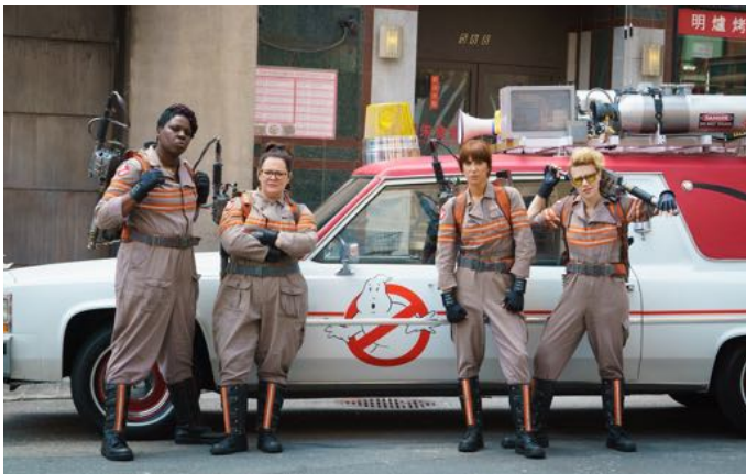
(Left to Right) Leslie Jones, Melissa McCarthy, Kristen Wiig, Kate McKinnon

We've seen all over the internet and social media about how bad the new Ghostbuster was going to be. But, after watching the movie, I thought it was actually good. Though there was some upsetting parts about the film, everything else was still okay. I think the best part of this movie are the characters. A lot of people complained that having female Ghostbusters cast would mess up the movie but, in my opinion, they did really well and were all funny in their own way. Patty Tolan (Leslie Jones) was really funny in the movie; Patty brought most of the laughter in the movie. Erin Gilbert (Kristen Wiig) and Abby Yates (Melissa McCarthy) were the smart and nerdy ones in the group. Erin Gilbert was the geeky one in the group who tend to get slimed the most. Abby Yates was the smart and sarcastic one in the group. Jillian Holtzman (Kate McKinnon) is the crazy engineer in the group. All these characters together make a classic funny sitcom, close to the old Ghostbusters.