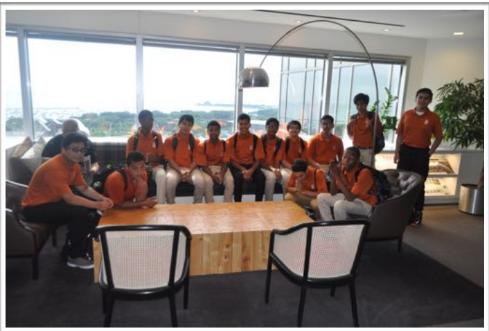
The PR Students inside Crain’s Chicago Business