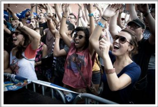
Wicker Park Fest - 2015