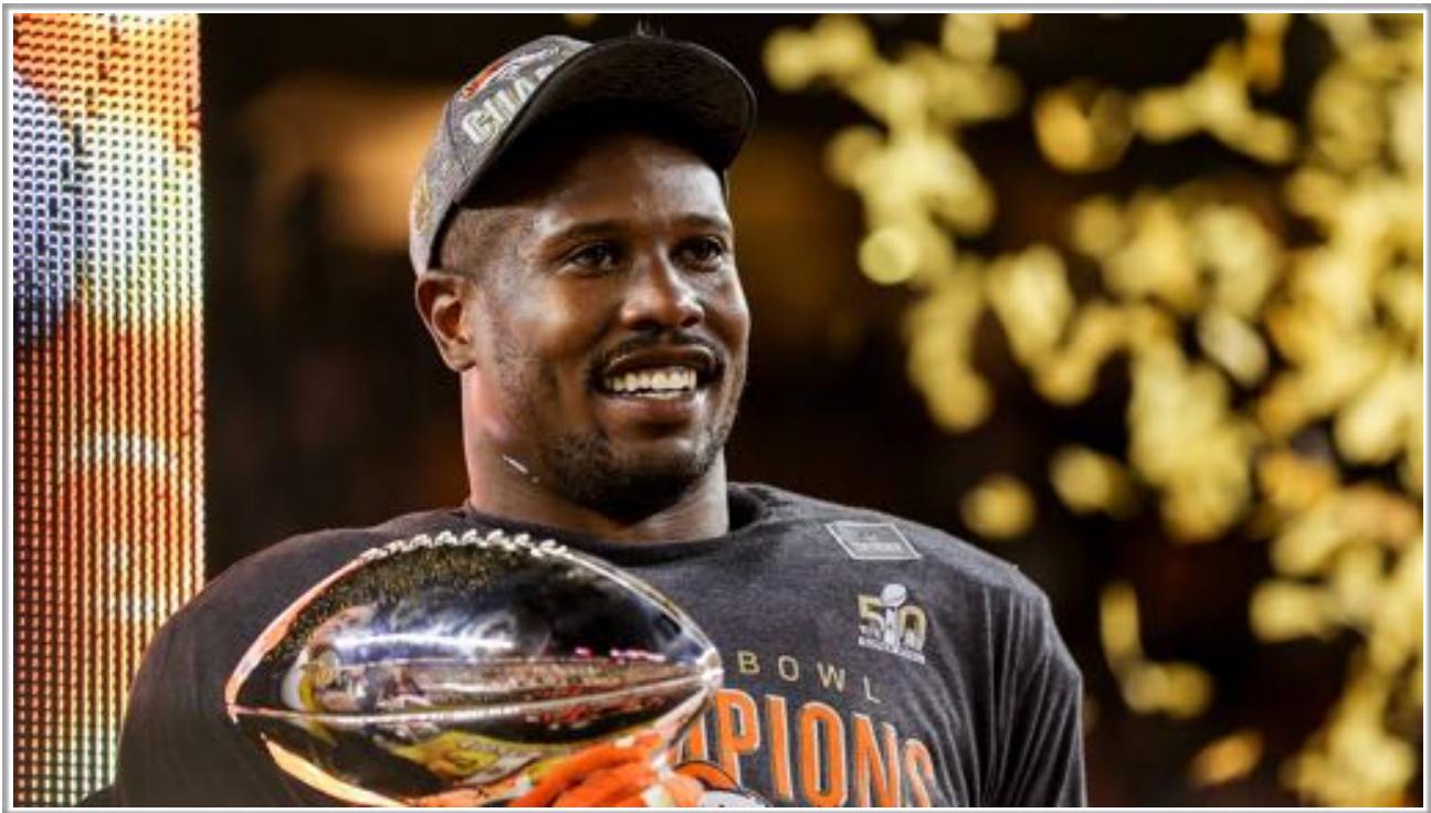
Miller was named Super Bowl 50 MVP after helping the Broncos dominate the Panthers 24-10 victory