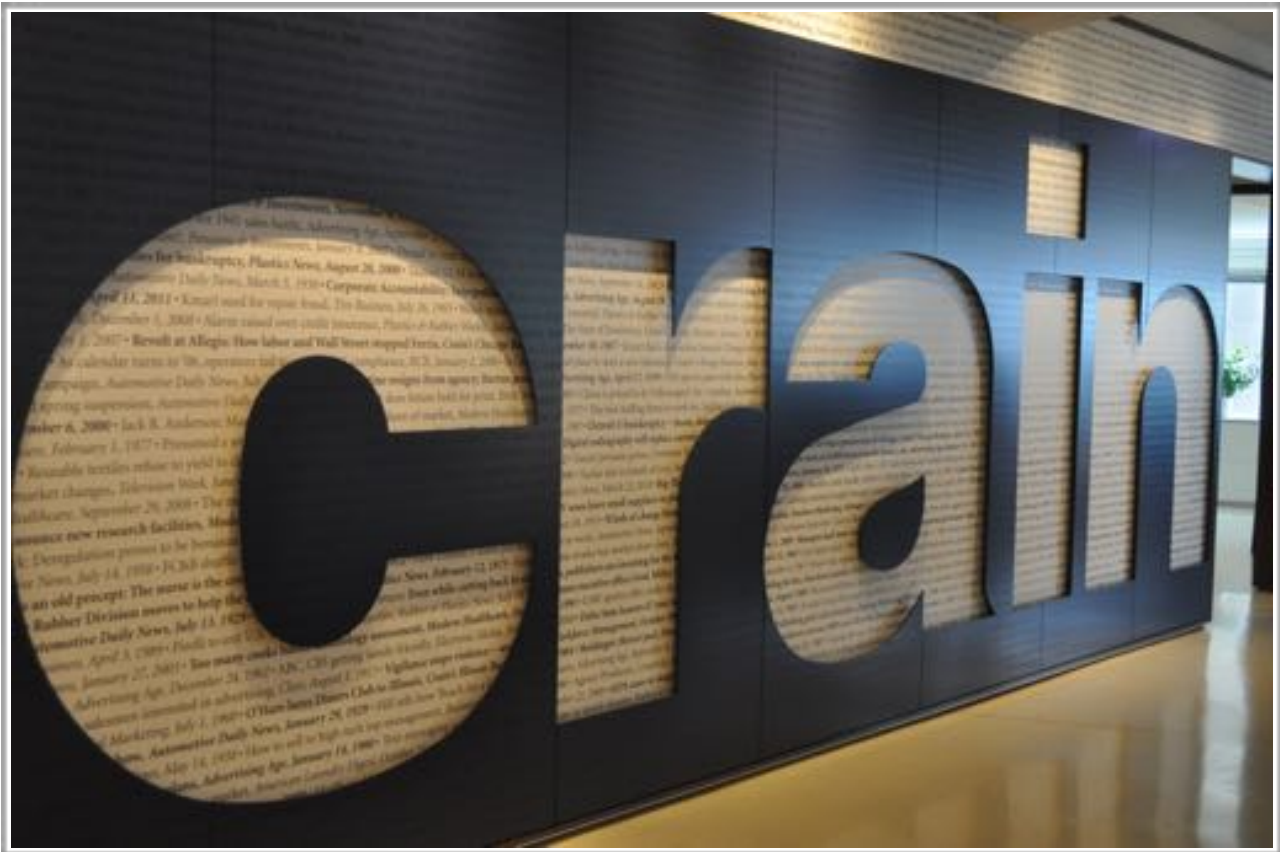
Inside the Crain’s Chicago Business Office

Crain’s can be found in 4 cities: Detroit, New York, Cleveland, and of course Chicago. Crain’s news can not only be found on the internet but their magazines are located in designated places, targeting their audience towards older businessmen so they can see what is going on in the business world.