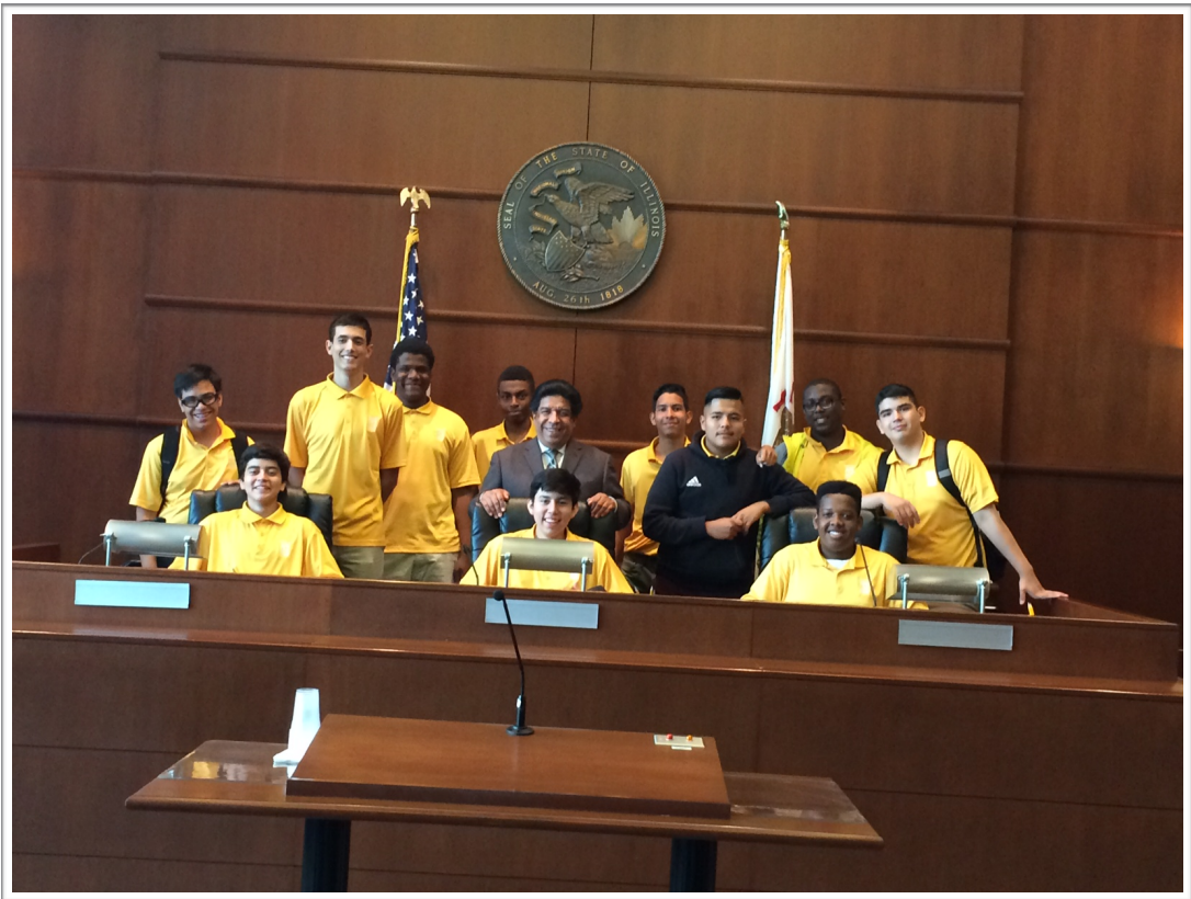
Law students photo op with Judge Reyes