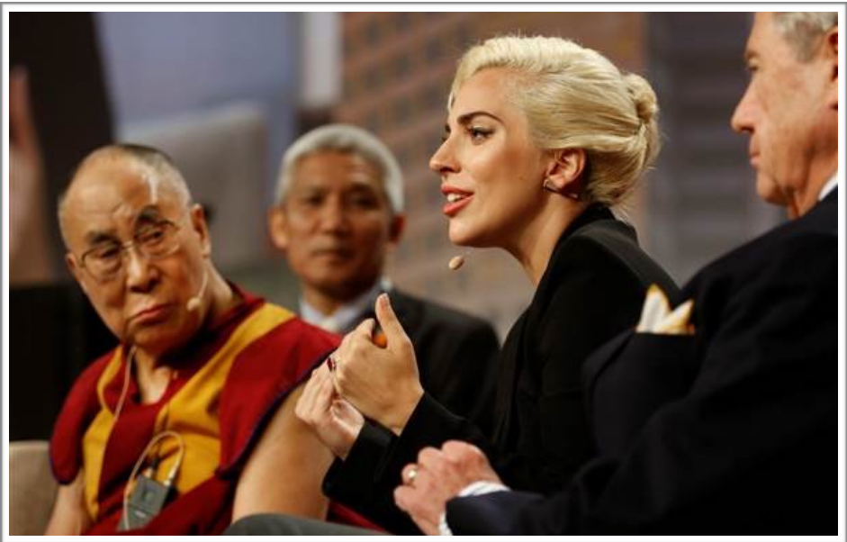
The Dalai Lama and singer Lady Gaga appear together for a question and answer session on "the global significance of building compassionate cities" at the U.S. Conference of Mayors 84th Annual Meeting in Indianapolis, Indiana United States, June 26, 2016

The pop star Lady Gaga has angered her Chinese fans after meeting with the Dalai Lama on June 26, 2016. The Dalai Lama does not have a good track record with the mainland Chinese, after he staged a failed uprising to free Tibet from Beijing’s rule he was exiled and had to flee to India where he still resides today. The Tibetan separations is a controversial figure amongst Chinese natives. According to The Guardian’s Associated Press, he has also made controversy amongst the Chinese people for allegedly supporting the Islamic State along with having “Nazi-like Policies” because of his opinions on Tibet and the Chinese mainland wanting to have a wall to separate the two countries.