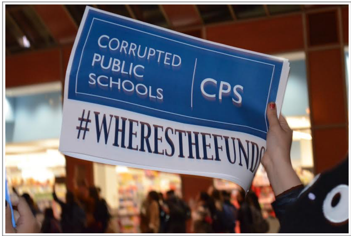
A sign from a strike on Chicago Public Schools