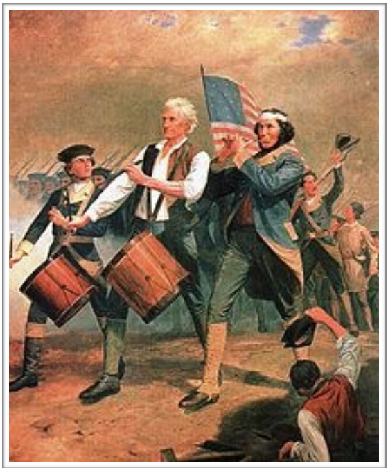
Originally entitled Yankee Doodle, this is one of several versions of a scene painted by A. M. Willard that came to be known as The Spirit of '76. Often imitated or parodied, it is a familiar symbol of American patriotism

Boom! Why is there loud noises outside? Sir, it is the 4th of July, the day when United States declared their independence. Oh really? Tell me more. Well sir, it all started off in 1776 when the Colonies went to war with the British, the most powerful country at the time. The cause for this war was because the colonies felt they were treated unfairly. The British government was putting taxes on most basic products, such as tea and paper, making it impossible for the colonies to buy them. Parliament raised taxes higher and higher, but would not give them any representation in the assembly. As the war came to its end, the 4th of July was announced the day of independence. The now called United States are independent and free from the control of the British. Wow, that was such an amazing story!