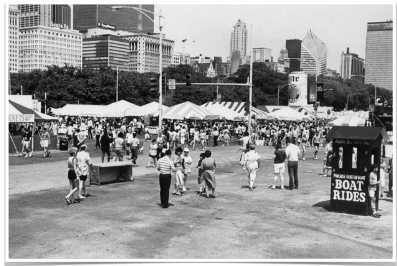
The city moved the Taste of Chicago to Grant Park from Michigan Avenue in 1981.